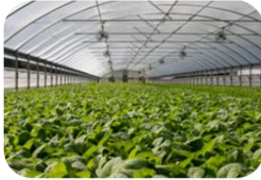
Greenhouses and shade houses