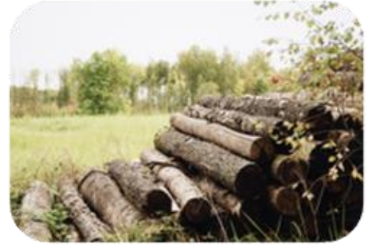
Use of forest products