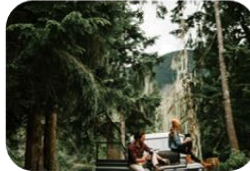
Ecotourism and sustainable tourism