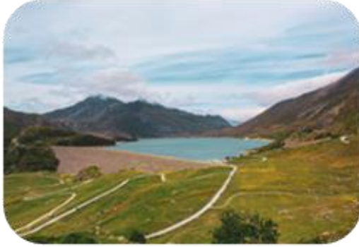
Small-scale water catchment, drainage and efficient irrigation systems