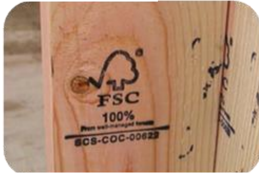
Certification for forest plantations and natural forests, among others